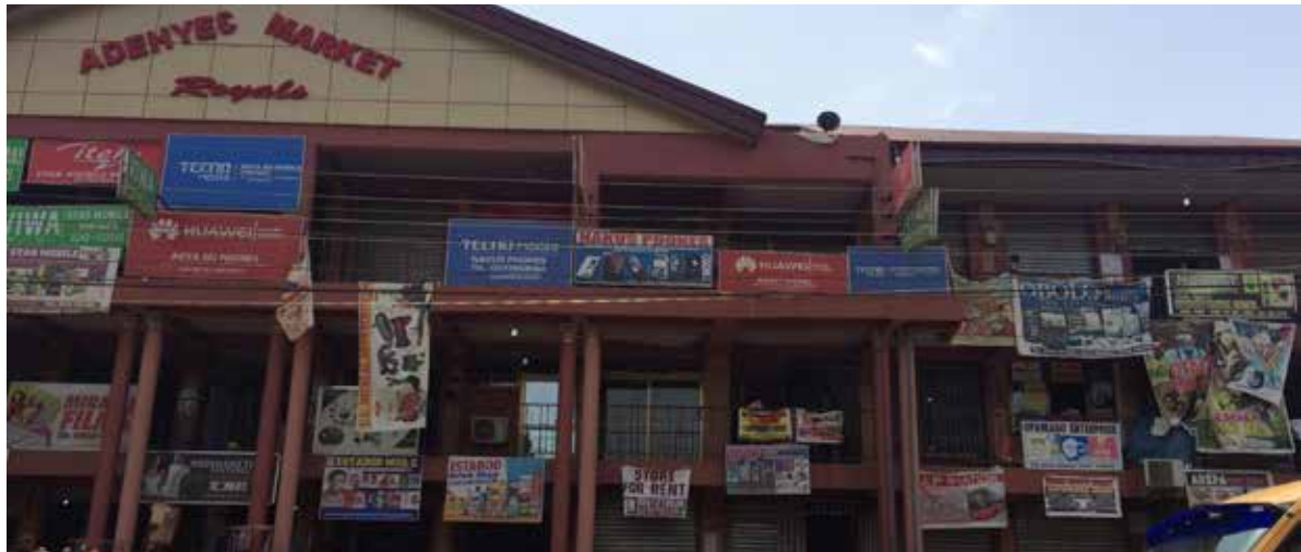
Adehyeman Market: One of two relocation sites for Kejetia store vendors. Adehyeman is multistory (three and four-story) shopping structure with capacity for approximately 400 market vending stores. Similar to the design of Acheamfour (below), this market has stores with a central, enclosed area with additional stores at the ground level. Street vendors operate throughout the ground level.