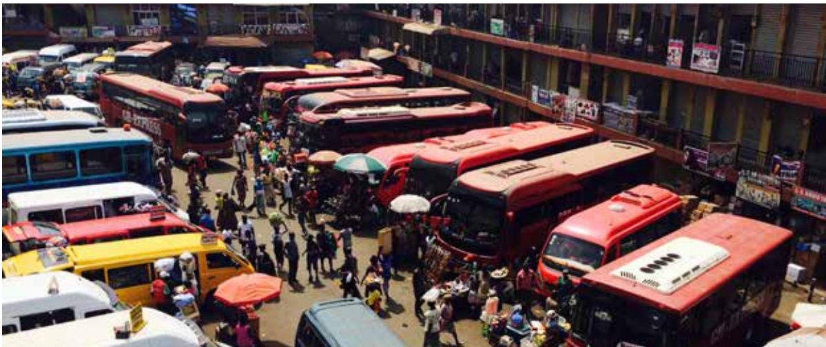
Acheamfour Shopping Mall and Lorry Station: One of two relocation sites for Kejetia store vendors. A multilevel (three and four-story) commercial shopping structure with capacity for approximately 600 market vending stores. The structure is a two-part development built by a private owner and located in the Kumasi Central Market area. The structure is designed as a series of multi-level shopping stores that enclose a major transport depot for buses and trotros (mini buses). At the time of the research study, additional construction of new stalls was underway behind the major structure as an annex to accommodate the relocated Kejetia market stall vendors. Street vendors operate throughout the ground level and at nearby streets.