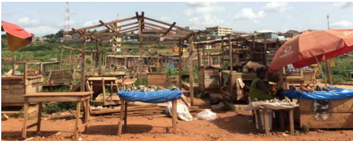
Table 2. KMA-Designated Relocation Sites for Kejetia Shop and Street Vendors

Race Course: Relocation site formally allocated by the KMA for street vendors. The space is a lorry park and transport depot where trotros (minibuses) and taxis load and drop off customers. The open, undeveloped area is situated approximately 500 meters off the main Mampong Road of the Central Market area and accessible only via two unpaved, dusty roads at either end. Street vendors operate from wooden tabletops and kiosks. The area is partially occupied by approximately 200-300 street vendors. Street vendors surveyed said they assembled their own infrastructure (wooden tabletops and kiosks) to trade here. The KMA has continually relocated street vendors to the Race Course area since at least 2005 and prohibited street vendors from investing in their commercial spaces to permanently establish themselves, a strategy the KMA employs to “keep [street vendors] away from public sight and for the purpose of maintaining city aesthetics” (King 2005).